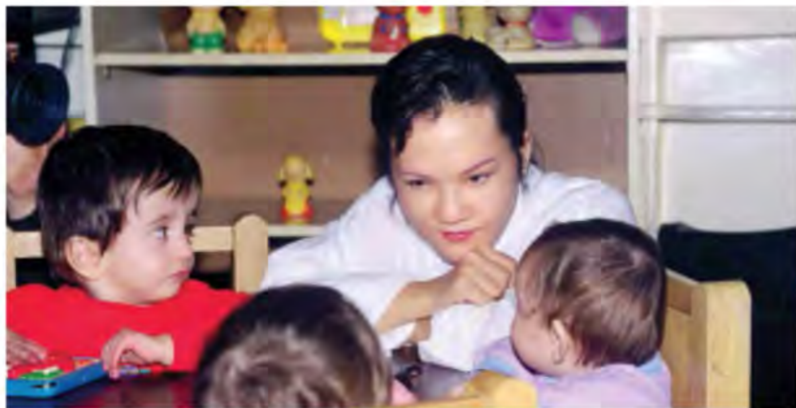
SUPREME MASTER CHING HAI SPENDS TIME WITH CHILDREN AT AN ORPHANAGE — YEREVAN, ARMENIA (MAY 18, 1988).

— THE HONORABLE FRANK F. FASI, MAYOR OF HONOLULU, HAWAII, USA — OCTOBER 25, 1993