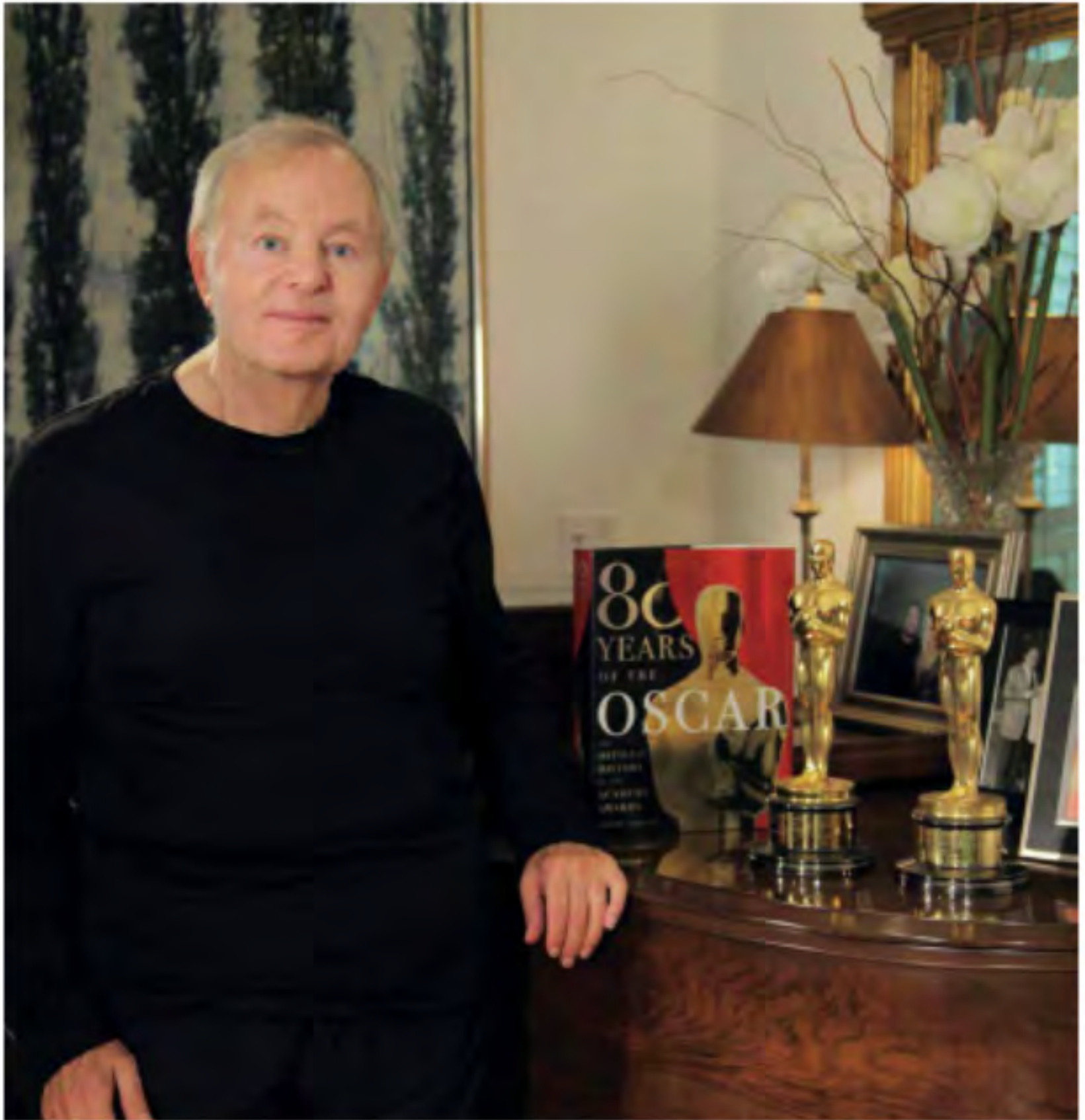
Loving the Silver Screen