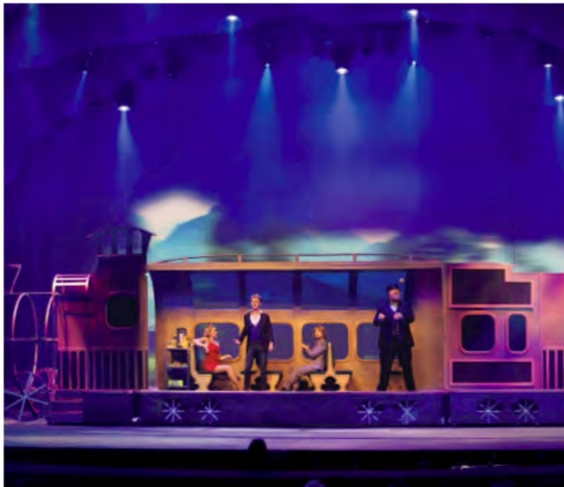
ON BOARD THE MAGICAL TRAIN.