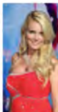
— KELLY PACKARD ACTRESS ( RAYWATCH ), VEGETARIAN

"I'm very proud of what you're doing for everybody. Happy Supreme Master Ching Hai Day today!"